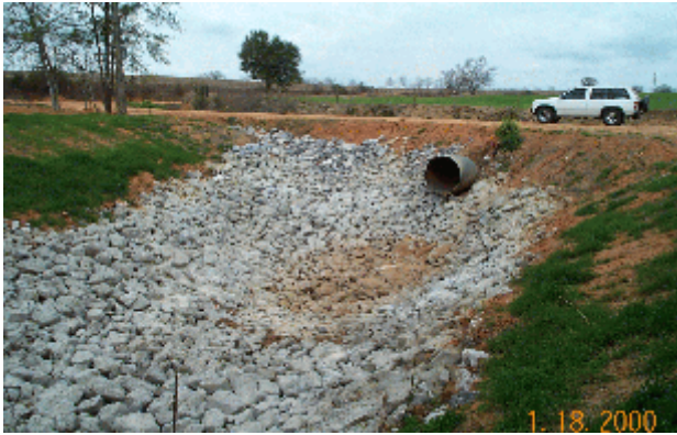
Major Cross Drains