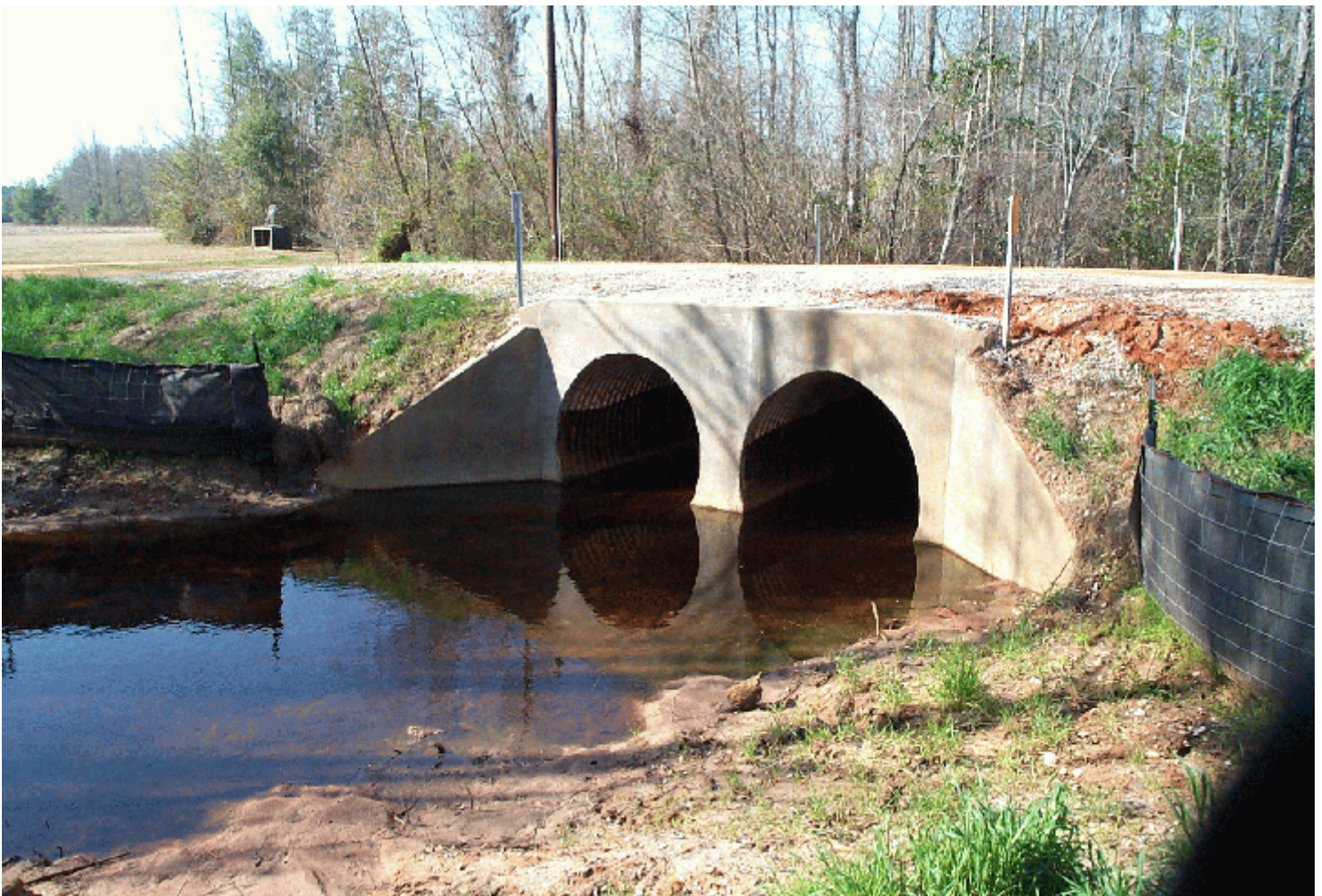
Exhibit 3.1a - Culverts for Stream Crossing