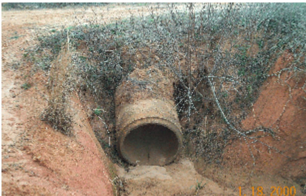
Miscellaneous Cross Drains

These usually connect road ditches on the upland side of a roadway to road ditches on the opposite side, or convey water to discharge points on the opposite side of a roadway.