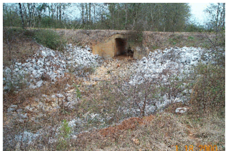
Exhibit 3.1b - Culverts for Crossing Natural Drains