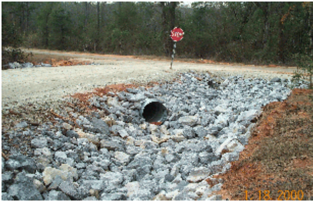
Intermittent Cross Drains

These usually facilitate large drainage areas which may include a network of roadway ditches, field drains, etc. and often discharge at a point in or near a natural stream or drainage.