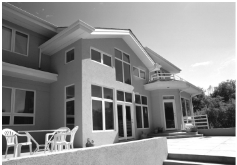
An example of direct-gain passive solar used in a residential building.

Comments: Because true north and magnetic north are different, the design team will need to account for magnetic decli-