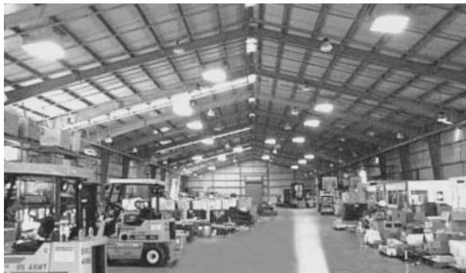
Daylighting retrofits for U.S. Army warehouse in Hawaii.

Comments: The best way to evaluate the lighting effects of window geometry and configuration is through computer analysis, using programs such as RADIANCE.