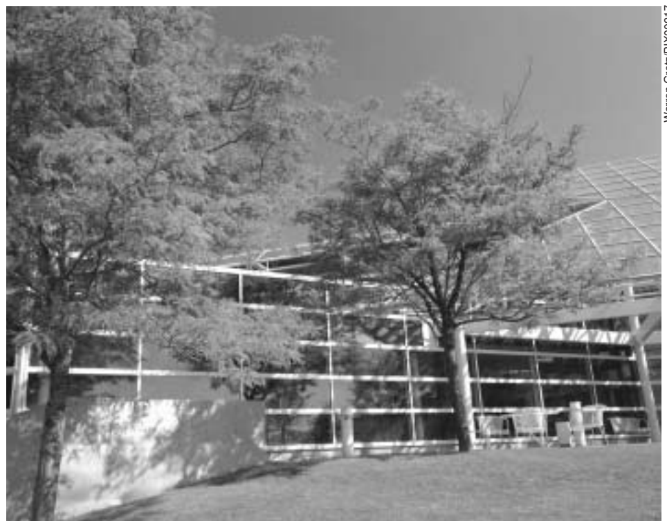
Shade from trees is a simple but effective strategy to reduce costly cooling requirements.

Comments: Daylighting is a central component of the vast majority of low-energy